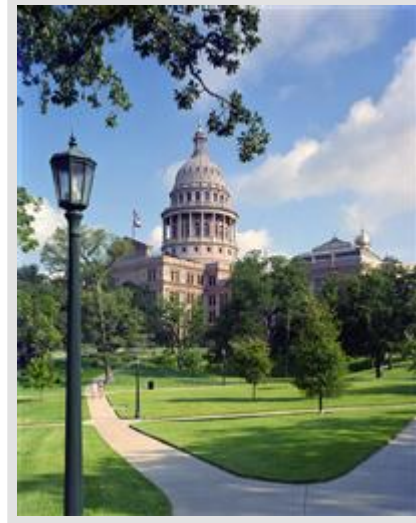
Texas Capitol