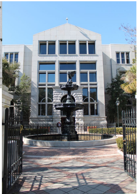
Photos: Left, courthouse and St. Michael's Church ; Above, National Register plaque; Right, new Courthouse Annex and courtyard