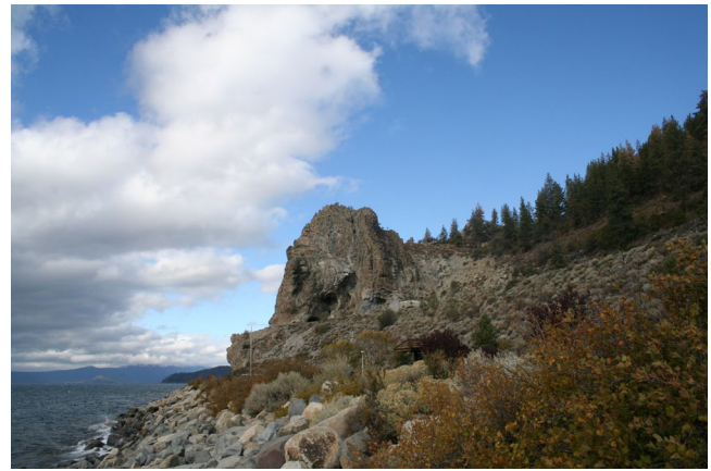
Photos: views of Cave Rock; Logan Shoals Vista Point sign about Cave Rock historic site