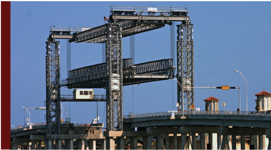
Above: Temporary bridge with lift; bridge for boat traffic adjacent to the historic bridge. Right: Bridge of Lions