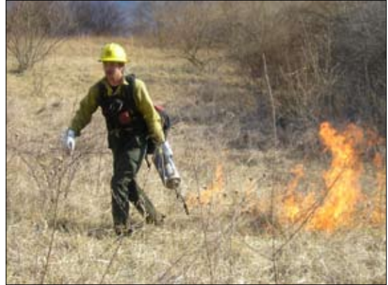
Prescribed burns are a management tool in the effort to prevent runaway wildfires and improve the forest ecology.

Specifically, the agreement allows the Forest Service, during the implementation of its prescribed burning program, to consolidate the initial steps (identification, evaluation, and assessment of effects) of the Section 106 process without consulting with the State Historic Preservation Officer (SHPO) on a case-by-case basis. The agreement also establishes a series of standard treatments which, if employed, will permit the Forest Service units involved to have a no adverse effect determination and not require case-by-case consultation. The agreement establishes how the forest will use the