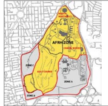
Zone map of the Armed Forces Retirement Home

The agreement focuses on those issues that could not immediately be addressed through consultation including specific mitigation actions that will be undertaken by AFRH, and subsequent developers for assigned portions of the property, addressing the direct and indirect impacts of rehabilitation and development on the Washington campus historic properties. It also outlines a process for future Section 106 project review