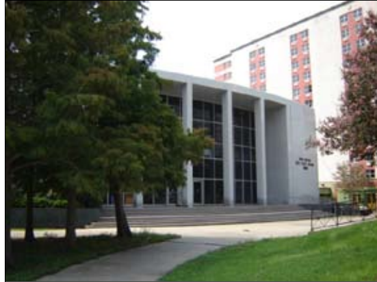
The Louisiana State Office Building Annex is the second of two 1958 structures that will be demolished to make way for a new structure.

The buildings were damaged by the 2005 Hurricane Katrina, which led to FP&C's decision to demolish both buildings and replace them with a single building. FEMA proposes to fund demolition as well as the construction of the new facility. FEMA is consulting with the Louisiana SHPO; the Advisory Council on Historic Preservation (ACHP); FP&C;