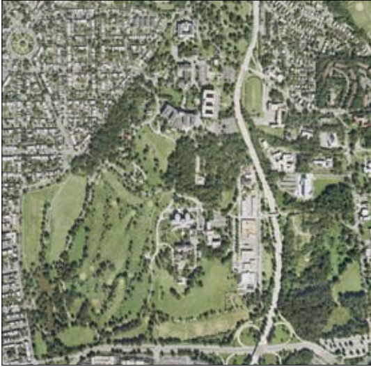
Aerial view of the Armed Forces Retirement Home

involved parties represented the following: Advisory Neighborhood Council 1A; Advisory Neighborhood Council 4C; Advisory Neighborhood Council 4D; Advisory Neighborhood Council 5C; the Catholic University of America; Committee of 100 on the Federal City; Crescent Resources, LLC; District of Columbia Office of Planning; DC Preservation League; Military Officers Association of America; National Trust for Historic Preservation; Petworth and Columbia Heights Residents Concerned; Rock Creek Cemetery Association; St. Paul's Episcopal Church; United Neighborhood Coalition; Ward 1 Councilmember; Ward 4 Councilmember; Ward 5 Councilmember; United States Soldiers' Home National Historic Landmark; and the President Lincoln and Soldiers' Home National Monument.