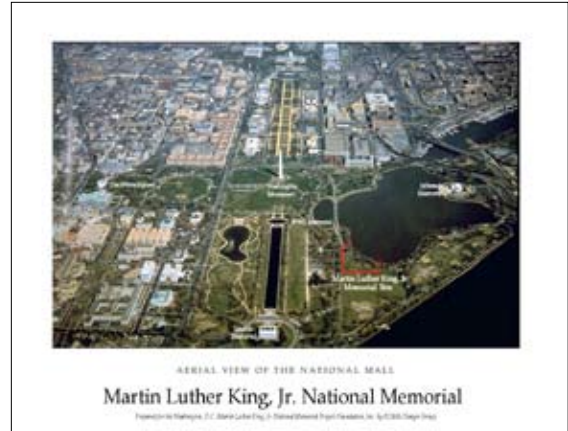
Aerial view of the National Mall looking east. The site where the Martin Luther King, Jr. memorial will be constructed is outlined in red.

With the NCMAC, the Foundation considered several potential sites and ultimately put forward as its preferred location a prominent site on the Tidal Basin that its members believed would properly reflect the exceptional significance of King's legacy. Once the Tidal Basin site was selected for the new memorial, the Foundation